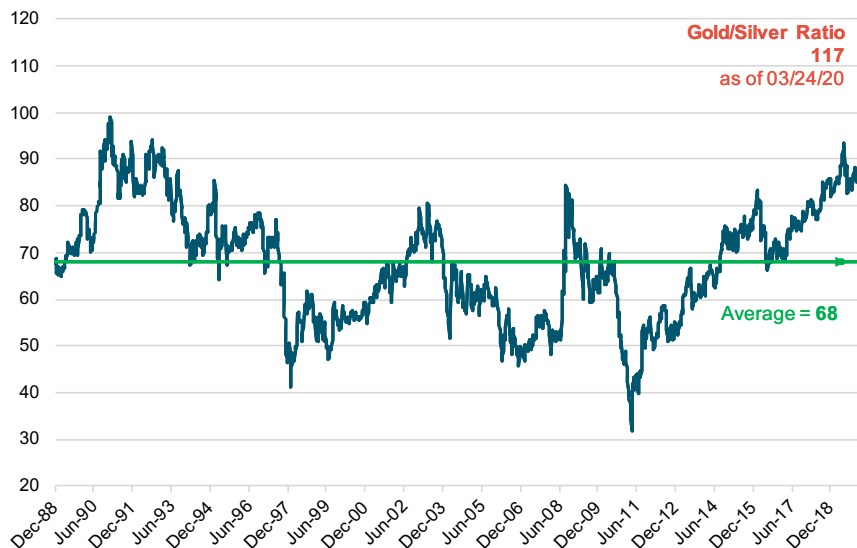
Figure 1. Gold/Silver Ratio is Highest on Record

Source: Bloomberg. Data as of 3/23/2020.